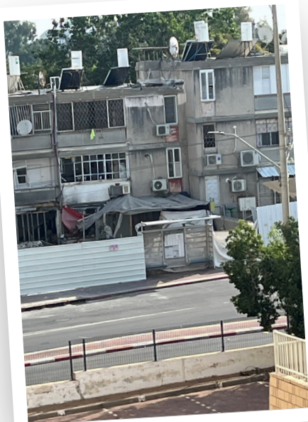
destroyed home across from our congregants

For five weeks, we could not conduct our worship services due to the missile threat and had to meet via Zoom. This past Saturday was the first time we could meet in person and participate in the Lord's Supper together. The worship and fellowship was sweet: "I was glad